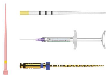
Fig. 1: ProTaper Ultimate is the fourth generation of Dentsply Sirona's flexible endo-file system with ProTaper-Ultimate-Absorbent-Point, AH-Plus-Bioceramic, Protaper-Ultimate-HandUse File and ProTaper-Ultimate-Gutta Percha (top down).

are available for > Download on the website.